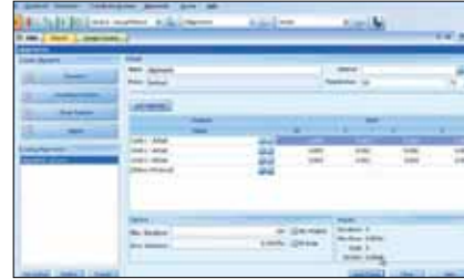
Best-fit alignment to CAD