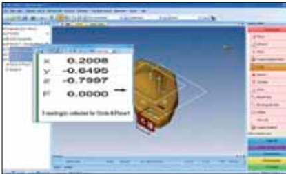
Auto association to nominals