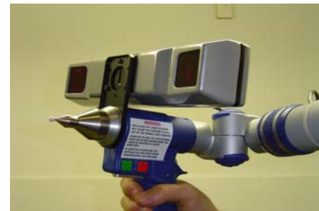
New SLP 2000 on LDI Faro Arm System

Physical Connection to Probe: Front-mounting holes. Adapter mounts available for standard Laser Design pucks, Faro Articulated-arm 7 th axis, all Renishaw shanks and PH-10 auto-joint.