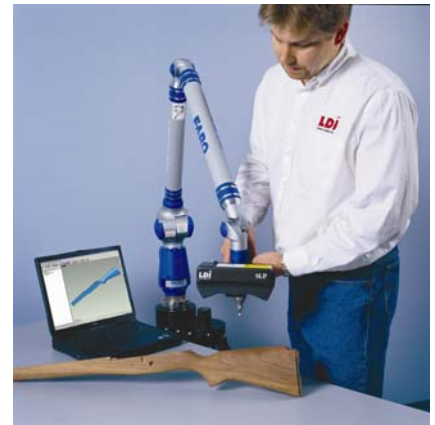
Laser Design Faro System with SLP

The Application Tools Library contains all the tools essential for data capturing, buffering, and outputting profile data. Consisting of ActiveX controls and available in object form for all the popular PC-based development environments, the library provides a straightforward integration path for application software developers and system integrators.